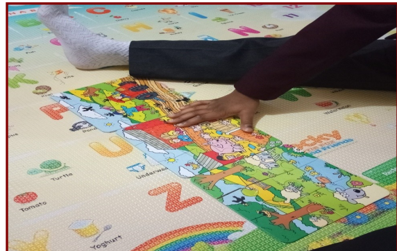
Organised patterns of muscular activities. Learning with puzzles is fun as it helps to build concentration skills in our heroes.