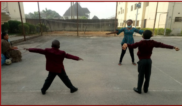
Outdoor activities with our VIPs, we are not only for academics.