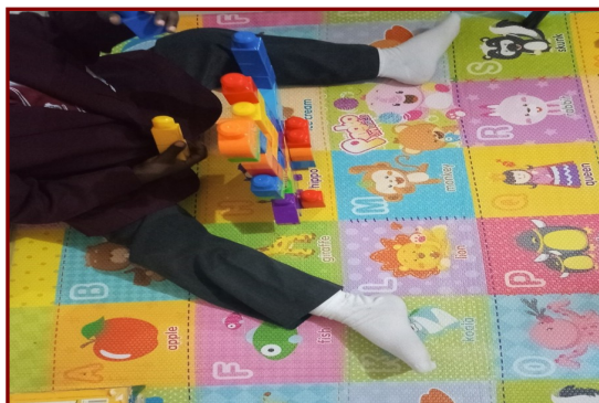
Psychomotor skills therapy helps to promote good eye to hand coordination